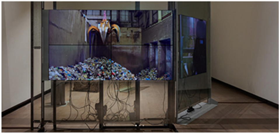
Picture 8: Eloise Hawser, The Tipping Hall, 2019, video sculpture, 19'

Gabriel Kuri's works of art are generally about discussing cultural values philosophically. An example of his artworks is the installation of Donation Box (Picture 7), which contains sand, cigarette butts, and coins, exhibited at the Kunstverein Freiburg, Germany (Griffin ao., 2014, p.147). In this work, the artist confronts the audience with the butts of the cigarettes they smoke due to habit and to stress out. The audience faces the consequences of bad habits with this work of art.