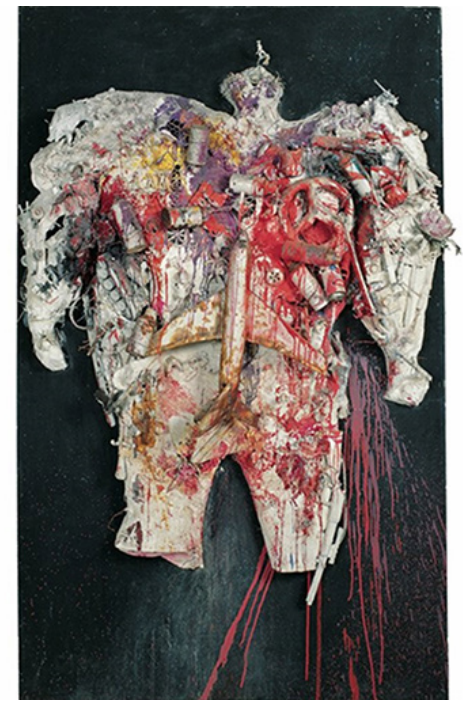
Picture 1: Niki de Saint Phalle, Death of Patriarch, 1961, mixed techniques on canvas

Such works of art called conceptual art aims to create an intellectual perspective in the audience's mind (Lucie-Smith, 2004, p.279). Contemporary art covers both Arte Povera and conceptual art. It is important on which policies the artists addressing the mind when they produce their works of art. The issues of public daily life and global perspectives are so important. Exhibitons in the public areas may be temporary. Contemporary artists can defend the antithesis of conventional patterns. Contemporary artists are looking for alternatives to modern life: Alternative ways of thinking, alternative exhibition environments, etc. There is no limited definition of contemporary art, because it is still looking for new potentials and new forms of expressions. New practices, techniques and methods such as ready objects, performing arts, collages, assemblages, land art, video art and new media arts expand the expressive possibilities of contemporary art. Thus, contemporary artists have options to express the concepts they want to express.